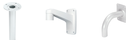
SBP-300CMW SBP-300WMW1 SBP-300WMW