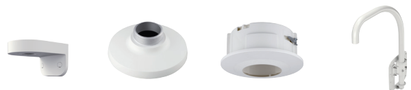
SBP-120WMW SBP-122HMW SHD-3000FW2 SBP-300LMW