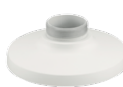
SBP-167HMW / SBP-167HM