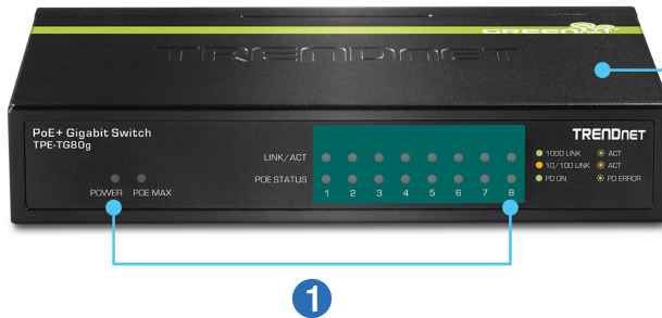
1 LED indicators