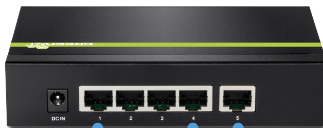
10/100 Mbps PoE ports